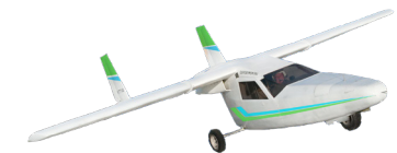
The Future of Personal Transportation...has arrived!